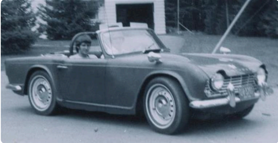
On our way to Lake George.